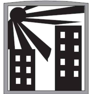
Fig. 4: Corrected Design