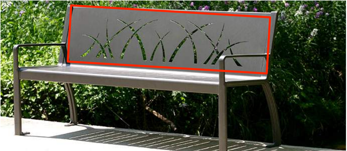
Fig.2: MLB970-M (the artwork will be placed in the red square)