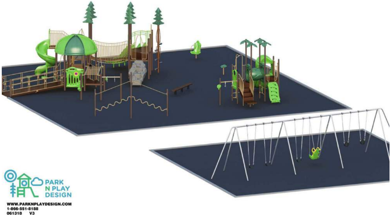
Fig.1: New play structure to be installed in Tansley Woods Park (preliminary)