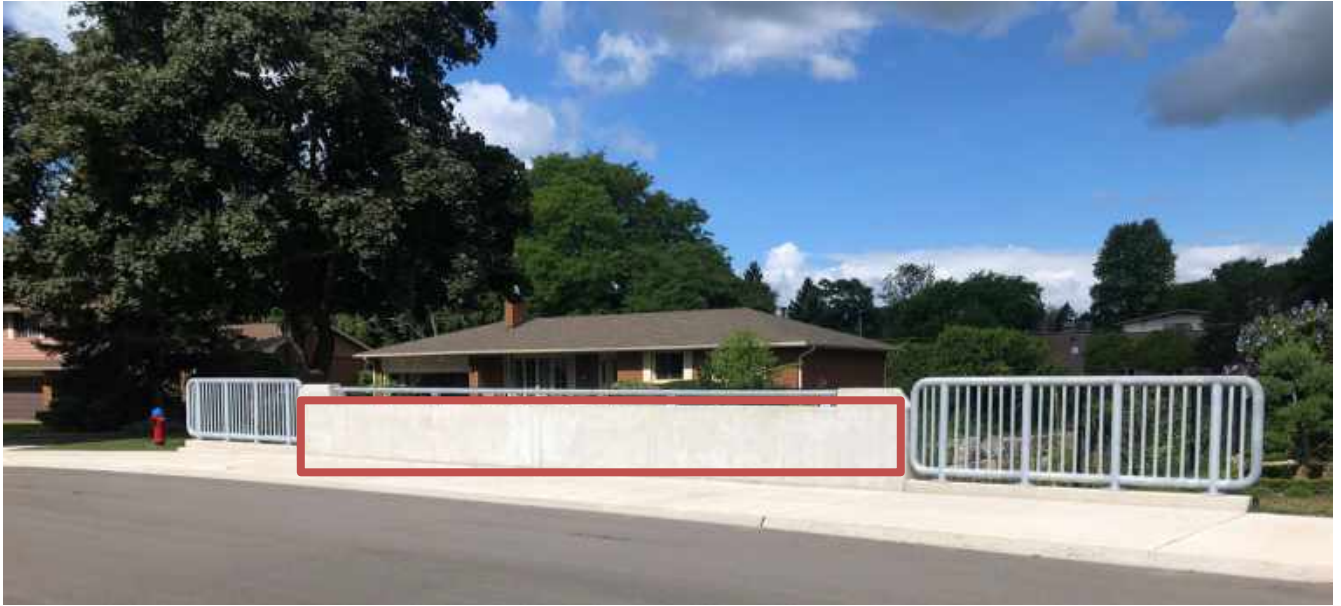
Fig.2: Tuck Creek