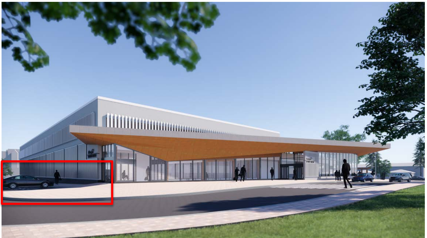
Fig. 1: Rendering showing main entrance of the new Community Centre, approximate artwork location marked with red square